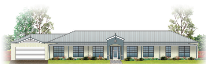
Modern Colonial Facade

Dimensions, photographs and sketches are approximate only and may include optional features. Check with your builder for local standard inclusions. Sketch Building Design Pty. Ltd. reserve the right to change plans, specifications, materials and supplies without notice.