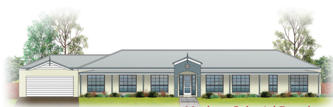
Modern Colonial Facade

Dimensions, photographs and sketches are approximate only and may include optional features. Check with your builder for local standard inclusions. Sketch Building Design Pty. Ltd. reserve the right to change plans, specifications, materials and supplies without notice.