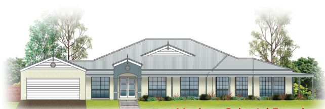
Modern Colonial Facade

Dimensions, photographs and sketches are approximate only and may include optional features. Check with your builder for local standard inclusions. Sketch Building Design Pty. Ltd. reserve the right to change plans, specifications, materials and supplies without notice.