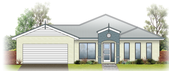
Modern Colonial Facade

Dimensions, photographs and sketches are approximate only and may include optional features. Check with your builder for local standard inclusions. Sketch Building Design Pty. Ltd. reserve the right to change plans, specifications, materials and supplies without notice.